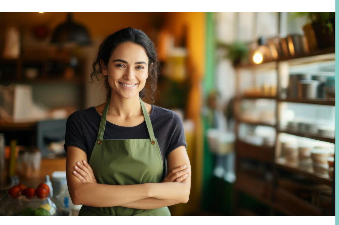
STROLL OVER TO THE RETAIL AREA IDEAL FOR THOSE INTERESTED IN LAUNCHING A BUSINESS OR WORKING IN RETAIL